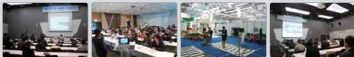
※ Events will be constantly updated on our website.